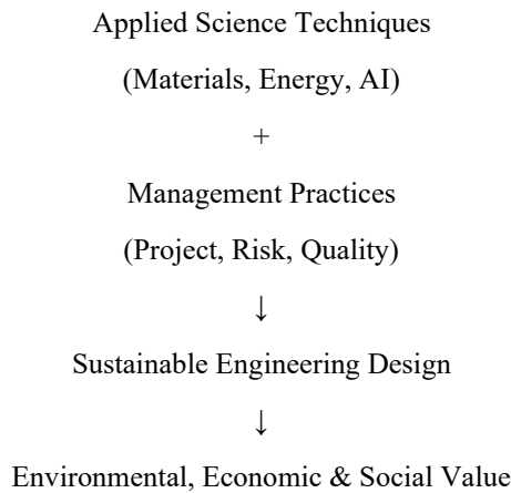
Chart 2: Integrated Sustainable Engineering Framework

Sustainability is best achieved through the integration of scientific innovation and management strategies.